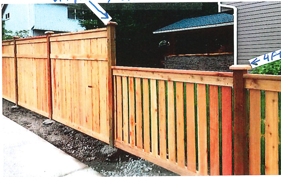
4ft Decorative fence