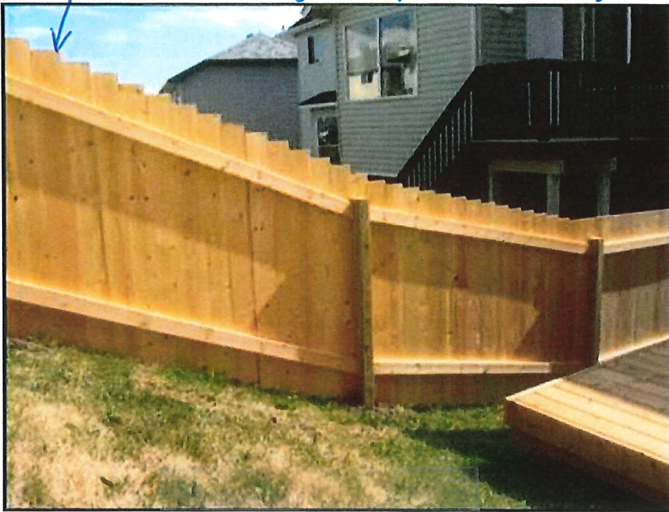
6ft privacy fence