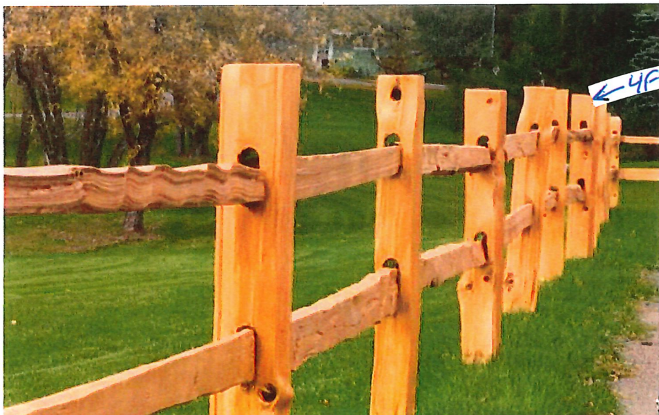
4ft Decorative fence